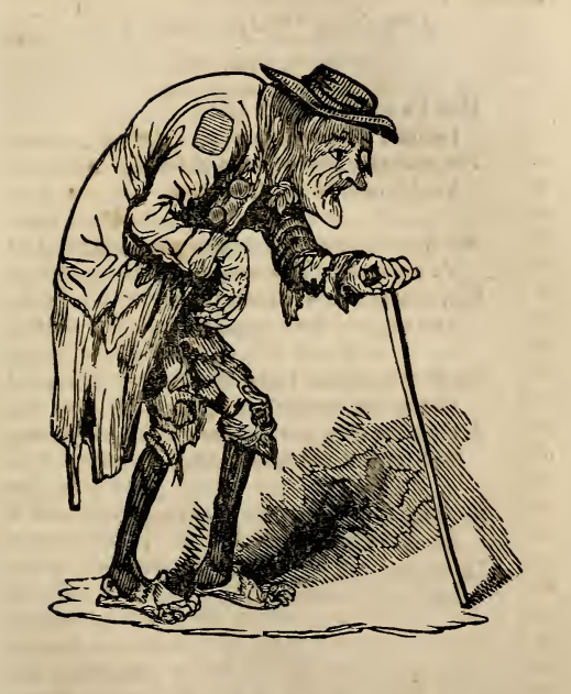
COME OF AGE.