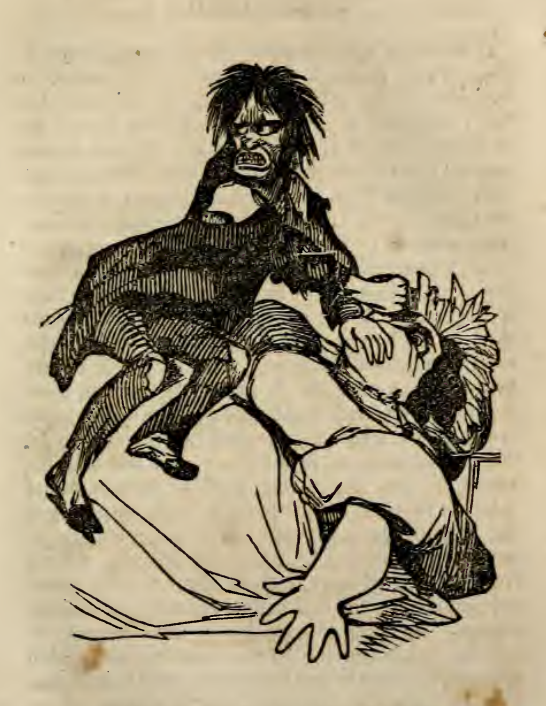
BURKE ON THE SUBLIME AND BEAUTIFUL