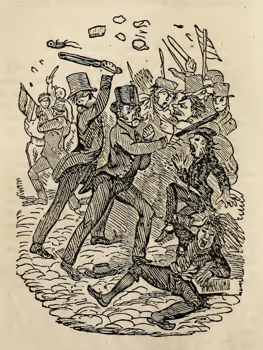
THE STAFF AT HEAD QUARTERS.