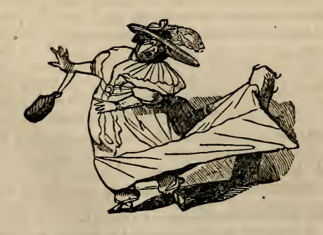
DISTRESS FOR RENT.

"Slaves cannot breathe in England; if their lungs Receive our air, that moment they are free: They touch our country, and their shackles fall."