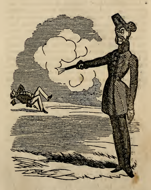
DROPPING AN ACQUAINTANCE.