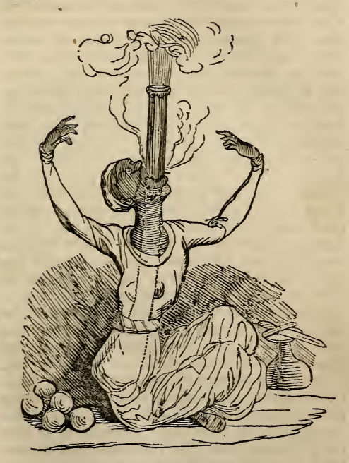
IN THE JUG'LAR VEIN.

Singers are habitually addicted to getting deeply in debt, for with them it is a mere matter of business to run up very high scores.