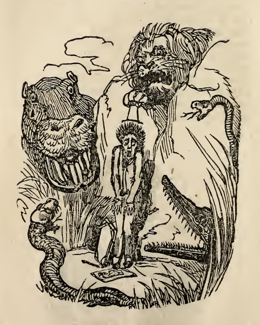
BEAUTIES OF NATURE.